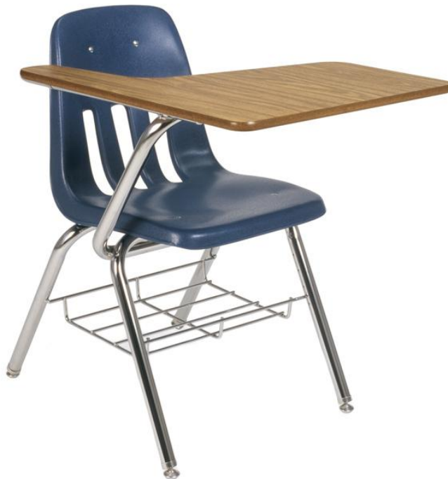
Code of Furniture